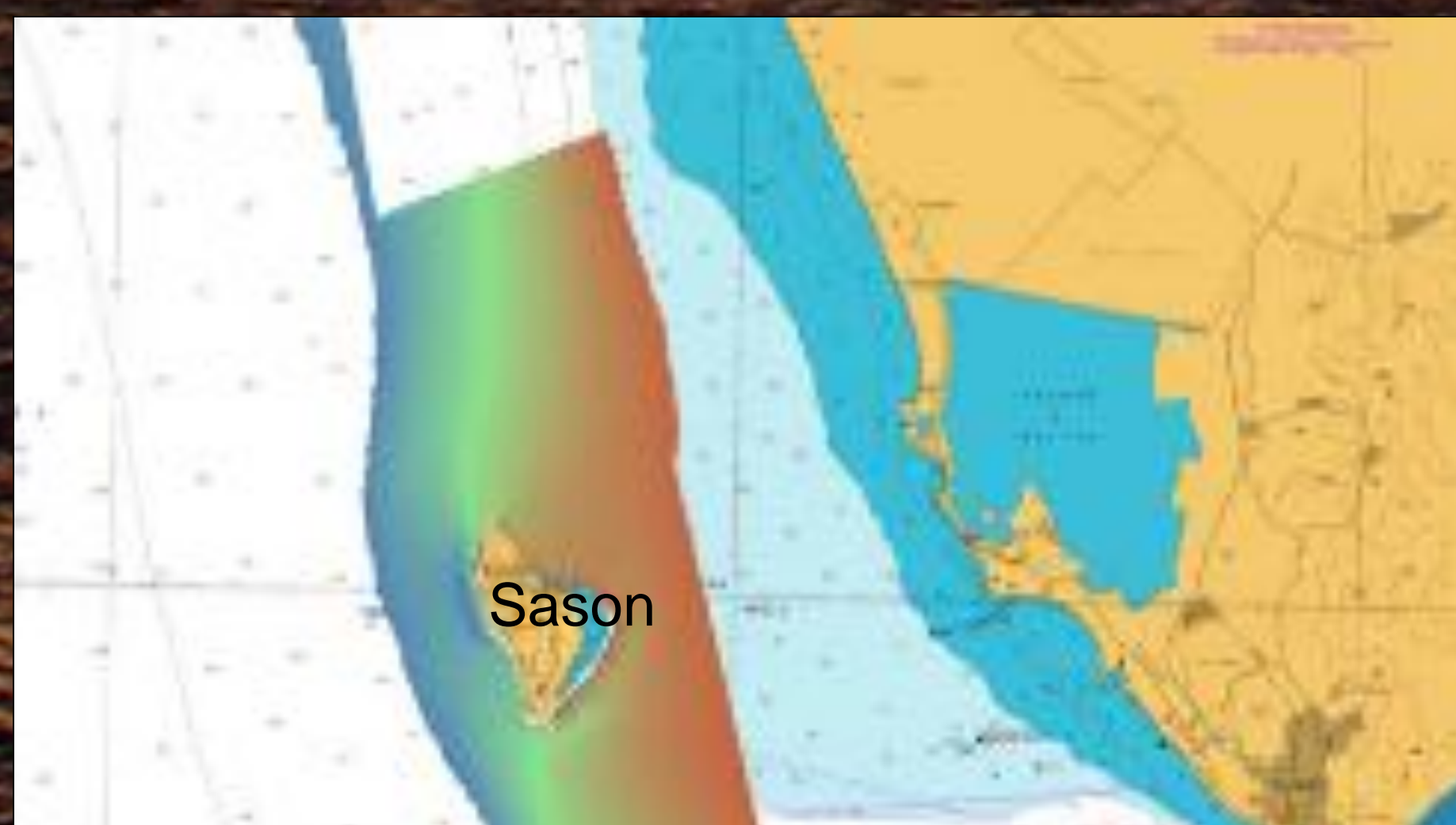
Figure 2 displays a CARIS HIPS image of the survey area completed in Albania during the 2011 field season. All data were collected no deeper than 100m.