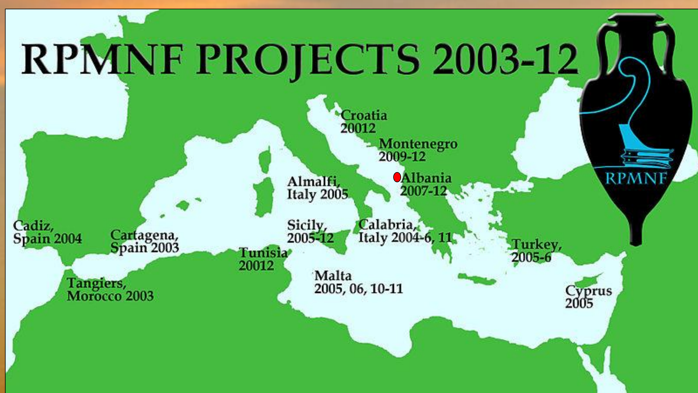
Figure 1 shows the locations of RPM sites explored since 2003. The red dot indicates the Albania location explored this (2011) season.