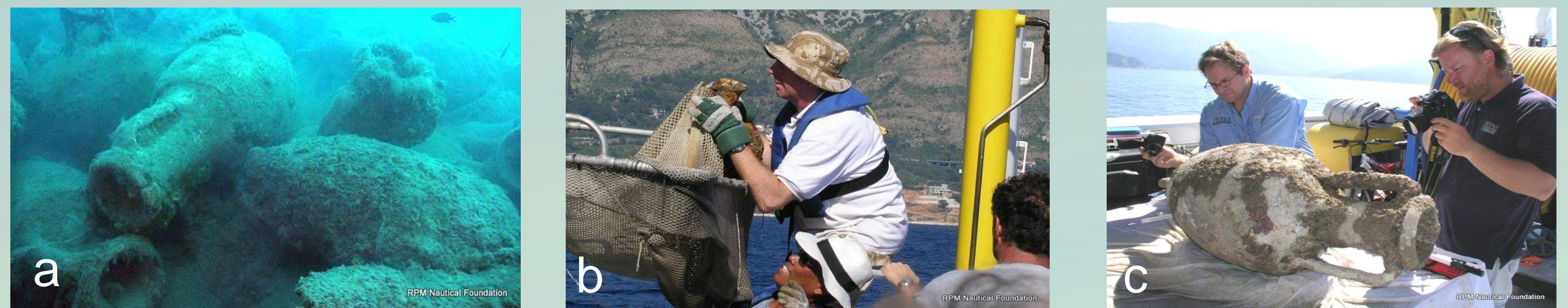
Figure 6 The product of finding ancient shipwrecks is seen above. Figure 6a displays the underwater view of a 1m high ancient shipwreck. Figure 6b shows ROV retrieval of amphora in waters too deep for divers to dive in. Figure 6c shows a cleaned amphora pulled from the same shipwreck site. The amphora found on this particular wreck site in Albania is of the type Lamboglia as determined by archaeologist Dr. Jeff Royal.